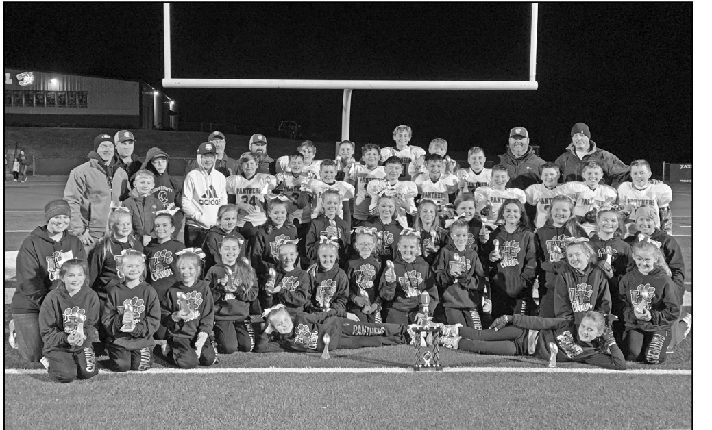
The Union County sixth grade football team and cheer squad following a 6-0 loss to Fannin County in the Mountain Athletic Conference Super Bowl on Nov. 13 in Dawson County.

Dawsonville - The sixth grade Panthers turned in an incredible defensive effort in a 6-0 loss to Fannin County in the MAC Super Bowl earlier this month.