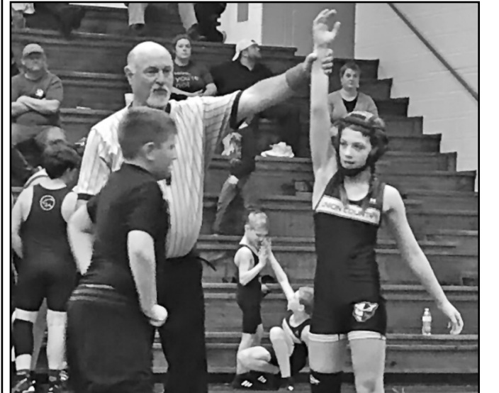
The UCMS grapplers were back on the home mat for the second time this season, scoring a pair of wins in a tri-match vs. Clear Creek and Rabun County. The Panthers edged Clear Creek (49-48) with Union winning on criteria following the last match. Union thumped Rabun 56-33.

hesitate." Union visits North Hall on Saturday before taking part in Towns County's annual King of the Mountain on Dec. 3-4.