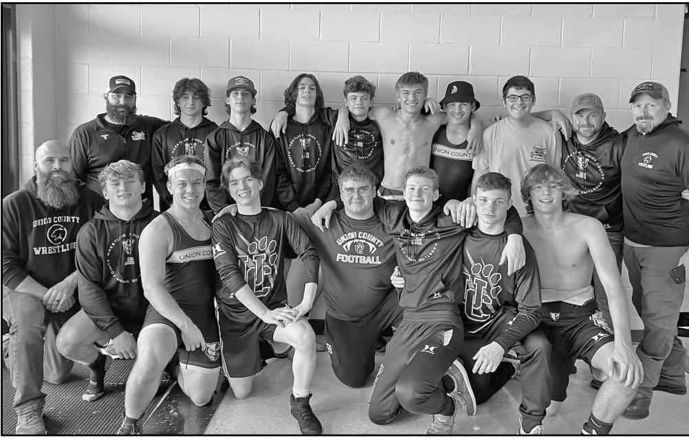
The Union County wrestling team last weekend following the Kenwood Classic in Clarksville, Tennessee.